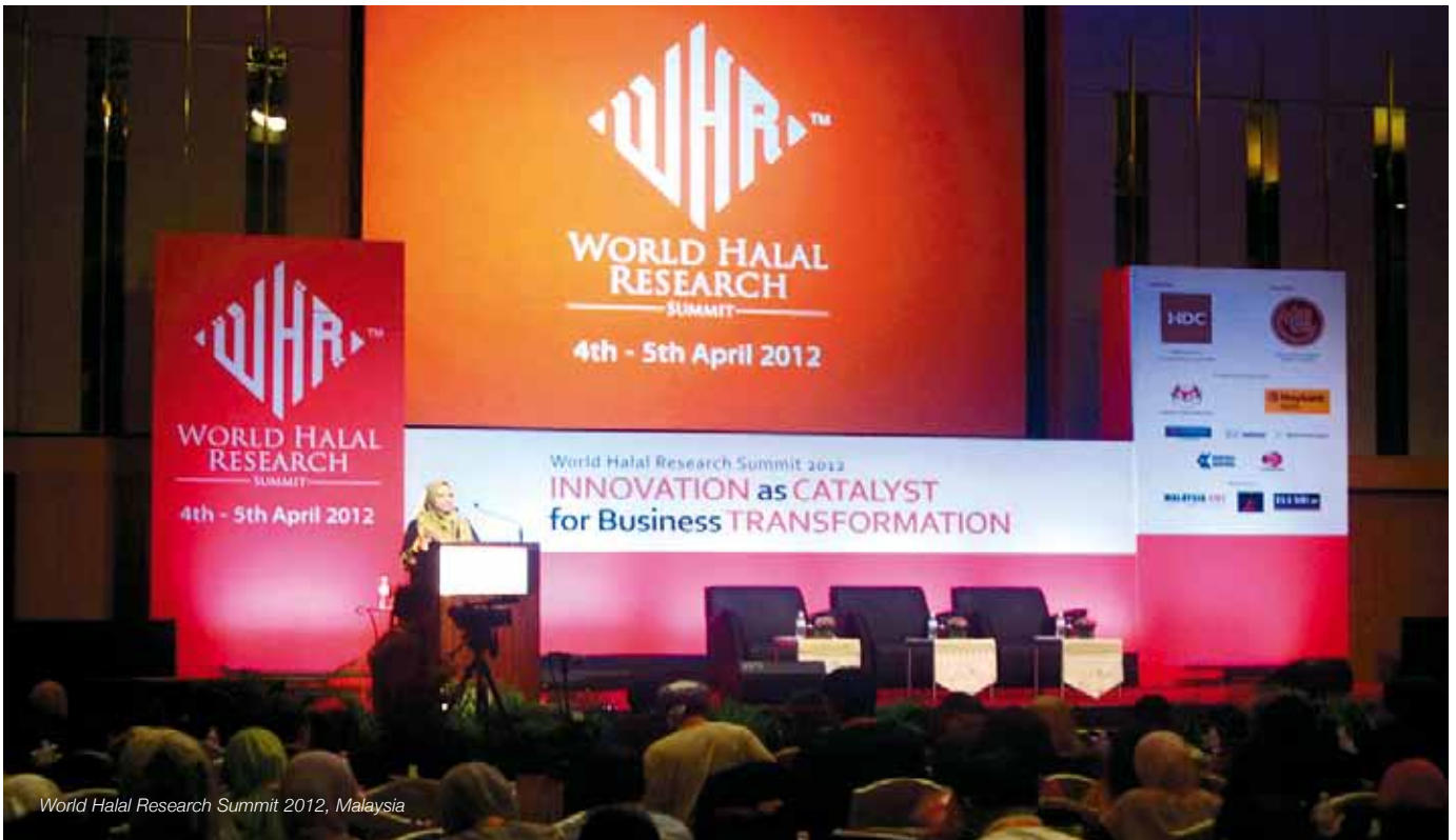
World Halal Research Summit 2012, Malaysia

Following two big wins in the 2011 World Halal Research Summit in Malaysia, Chulalongkorn University's Halal Science Center once again captured the "Best Innovation in Halal Logistics" award from the 2012 summit. With two wins in consecutive years in this category, the Center's achievements have underlined Thailand's status as a leader in the field of Halal science.