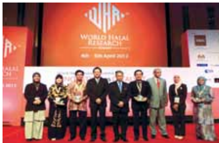
The CU Halal Science Center receives the "Best Innovation in Halal Logistics" Award for the second year in a row.

Halal Science Centre, Chulalongkorn University received the award for the research project titled "Two-Dimensional Barcode Application Incorporated with Najis Cleaning Procedure for Preparation of Promising HAL-Q Halal Logistics and Traceability System", which concerns the development of the SILK (Shariah-compliant ICT Logistics Kontrol) system. SILK consists of several software modules, one of which uses 2D barcodes instead of more expensive RFID (Radio Frequency Identification) technology to track shipments of Halal goods. Additionally, 2D