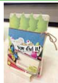
Every "beleaf" product must be eco-friendly either in the choice of raw materials, production techniques or disposability.

"Our products are things we use in everyday life, such as stationery, design-focused gifts, and various household items. Every beleaf product