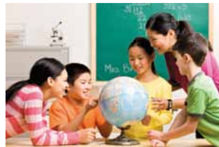
According to ASEAN Secretary-General, ASEAN nations are required to quickly develop the quality of their human resources to ensure competitiveness on the regional stage.

In his address, Dr. Surin expressed belief in Chulalongkorn University as a key player in developing Thais into global citizens. "The exhibition we have here today represents the combined efforts of Chulalongkorn University's faculties and departments," the ASEAN Secretary-General noted. "I can say with confidence that what I have seen is well beyond my expectations and deserve to be seen by the general public as a great reminder of the issues we face. The only thing that prevents us from becoming competitive is our own failure to prepare. If we cannot step up