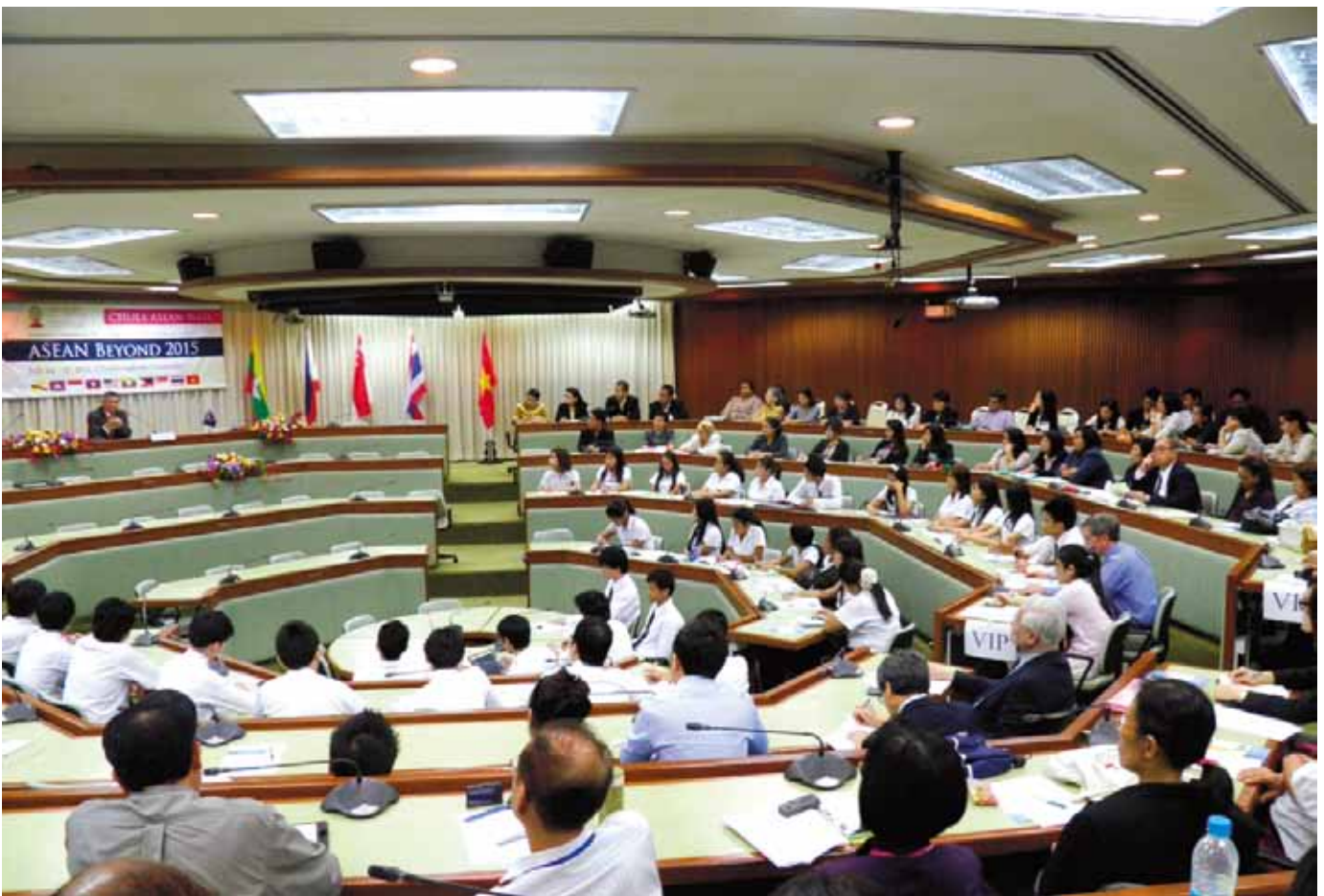
Students, academic staff and the general public attend the "ASEAN Beyond 2015" seminar at CU.

As the year 2015 edges closer, public interest in the ASEAN Community is bound to grow exponentially in anticipation of widespread changes it will bring. With all parties preparing for the coming transformation, Chulalongkorn University – in recognition of its responsibility as a pillar of the Kingdom in ASEAN studies – stands ready to provide support through the establishment of the ASEAN Studies Center of Chulalongkorn University.