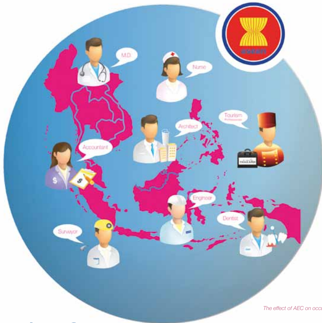
The effect of AEC on occupational freedom