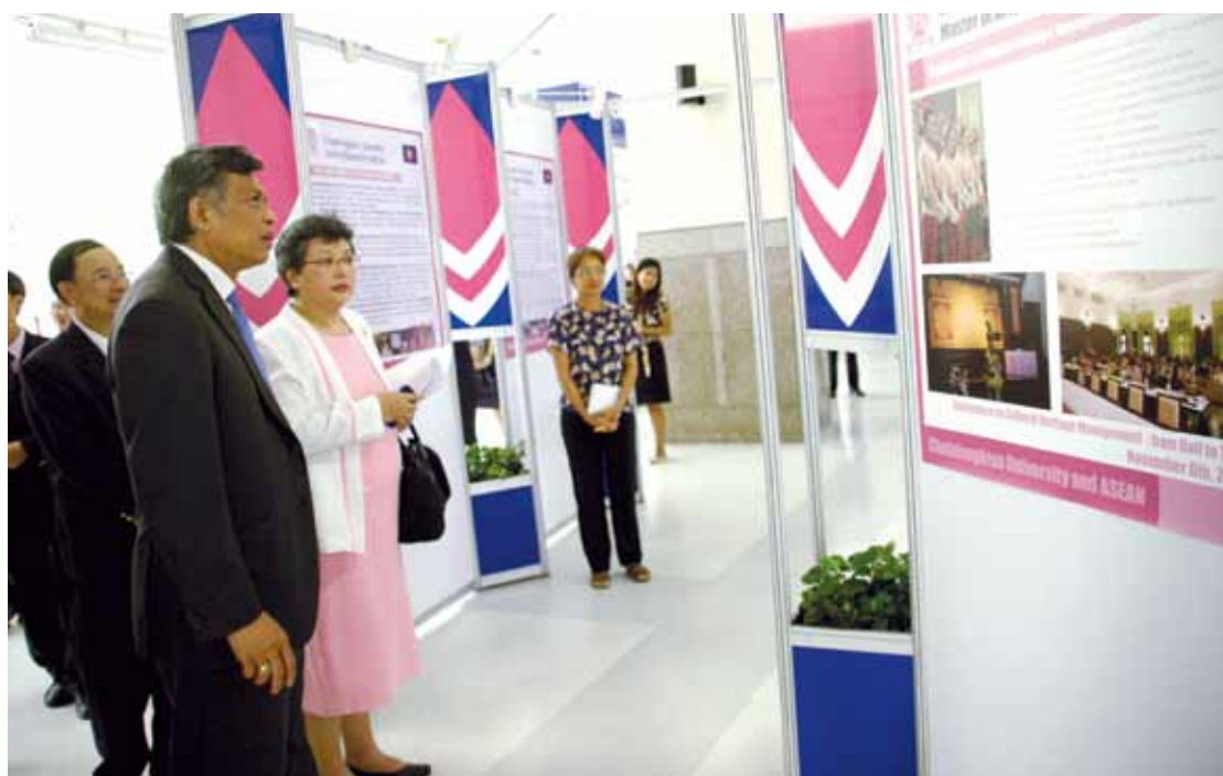
The ASEAN Secretary-General and CU administrators view an exhibition at the "Chula and the Road to ASEAN Community" event.

our human development efforts, we stand to miss out on the opportunities presented to us in the coming integration with the region. However, given these capabilities and resources, I have no doubt as to Chulalongkorn University's ability to step up to the task."