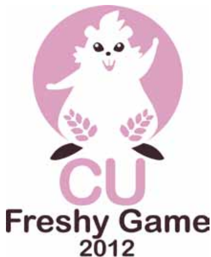
"Beaver", the official mascot of the CU Freshy Games 2012