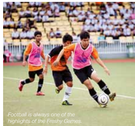
Football is always one of the highlights of the Freshy Games.