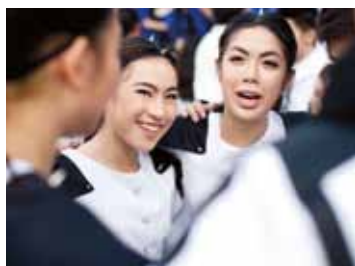
Lovely moments from the cheerleading teams