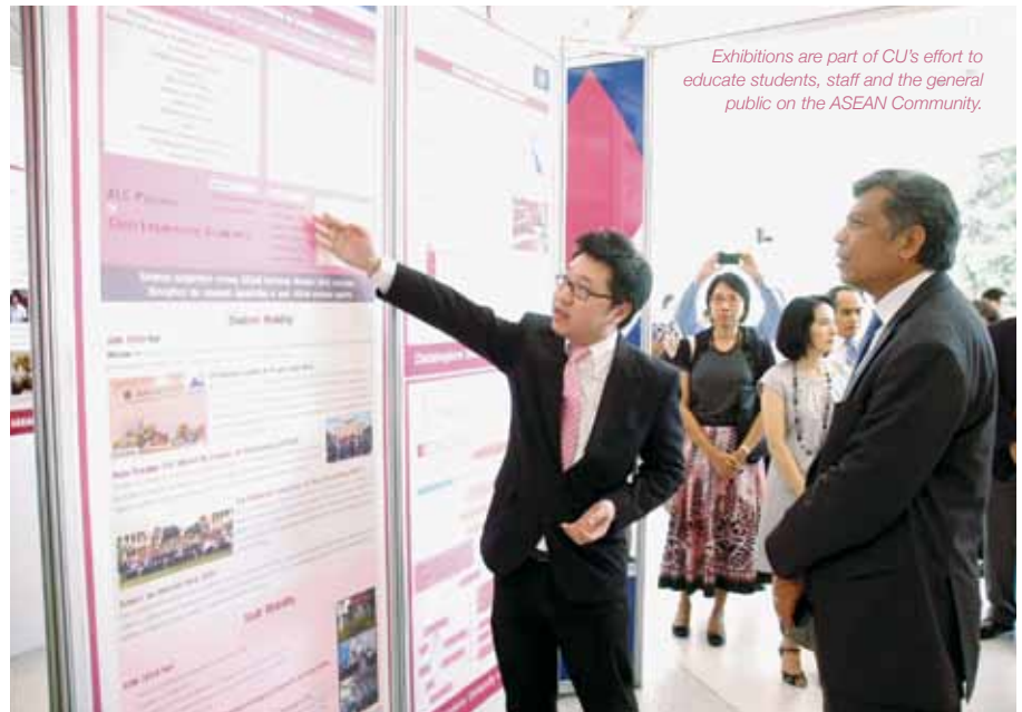
Exhibitions are part of CU's effort to educate students, staff and the general public on the ASEAN Community.