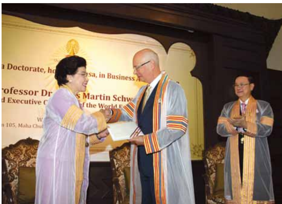
Professor Klaus Schwab receives an honorary degree from the chairperson of the Chulalongkorn University Council.

It was a great pleasure for Thailand to have been chosen as the official host for the World Economic Forum on East Asia 2012 on the topic, "Shaping the Regions Future Through Connectivity". The forum, held in Bangkok between May 30 and June 1, 2012, drew more than 500 participants, including political and business leaders and members of the press from all over the world.