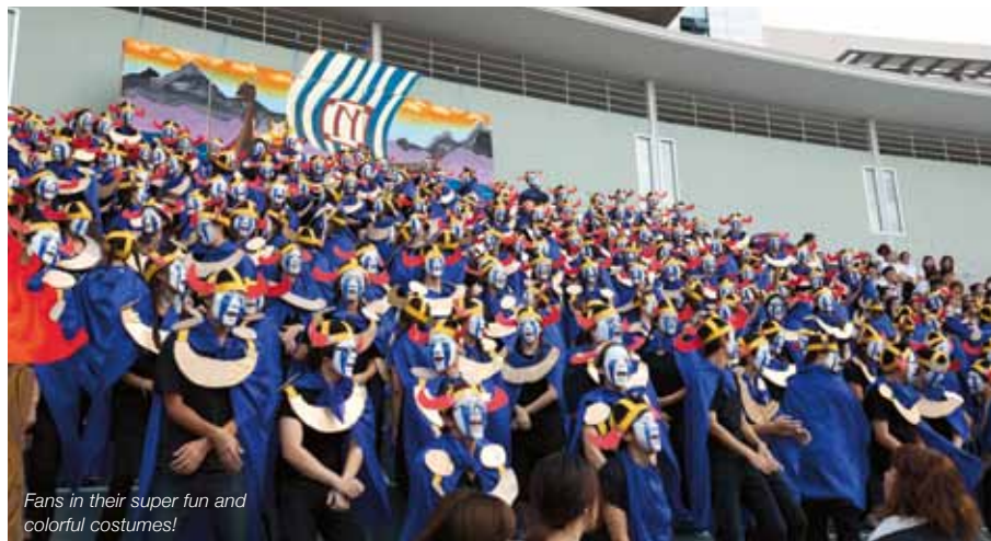
Fans in their super fun and colorful costumes!