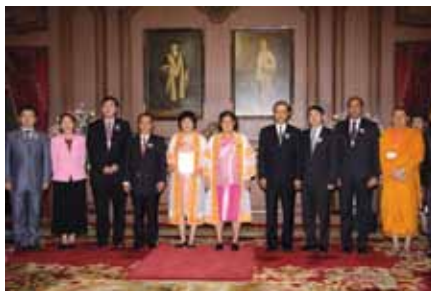
HRH Princess Maha Chakri Sirindhorn confers an honorary Doctor of Arts degree on China's Director of the Confucius Institute Headquarters (5th from left).

Hanban and Chief Executive of the Confucius Institute Headquarters in the People's Republic of China. Her exceptional talents and notable dedication have been the driving force behind the establishment of over 350 Confucius Institutes around the globe in just eight years. With 500