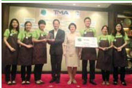
The Green Life Society Team from CU receive the "Green Business Plan" award.

new ideas. If we can get them interested in environmental issues now, then they will eventually become a major driving force behind a greener mindset for society," the group said.