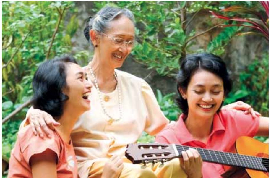
Research by a CU Nursing graduate shows that music helps reduce anxiety in elderly adults with dementia.

The research began with training courses designed to help caretakers spot behavioral changes in the patients. To minimize the chance of such changes, interior environments were changed to eliminate possible stimuli, such as rooms that were too well-lit and annoying sounds or odors. The caretakers then began to interact with the elderly patients regularly over a period of 2-3 months to familiarize both sides with each other. This eventually led to various planned activities, such as group sessions where patients were drawn to pay attention to songs they loved – e.g. Suntharaphon tracks – instead of other external stimuli. Their focus was further enhanced by activities such as use of tools or instruments to create rhythms that matched those of the music or encouragement for the patients to sing along. These exercises – performed three times a week