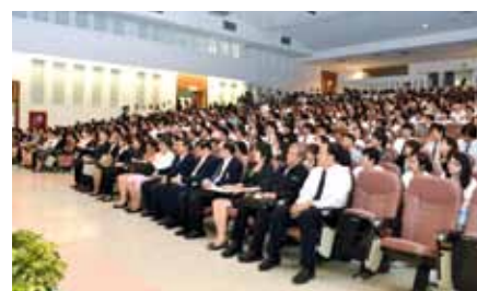
The conference on the ASEAN Community draws a large audience at Chulalongkorn University.

our human development efforts, we stand to miss out on the opportunities presented to us in the coming integration with the region. However, given these capabilities and resources, I have no doubt as to Chulalongkorn University's ability to step up to the task."