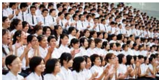
Freshmen fans in the neat & clean version