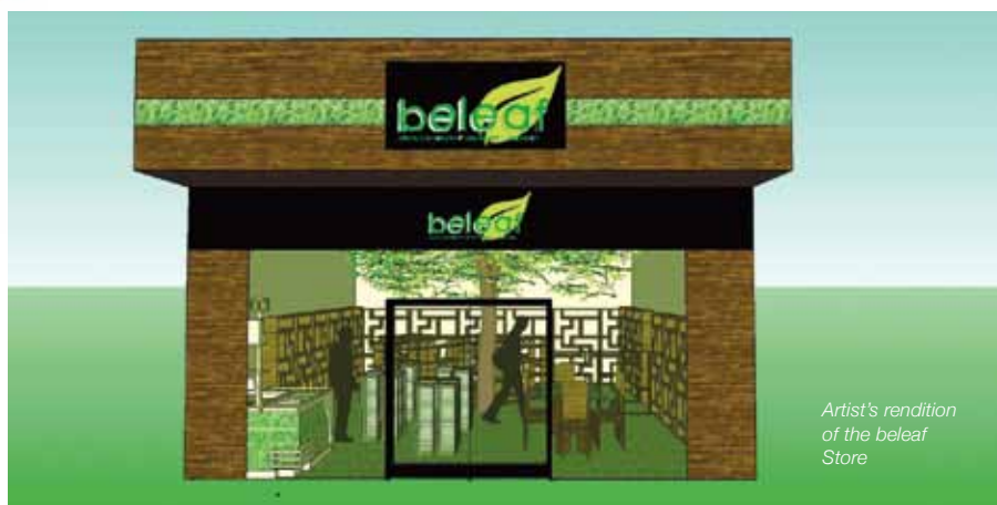
Artist's rendition of the beleaf Store

The team had lofty goals for their business plan. "We wanted to create a store that can change how people think and also change the world. We immediately targeted teenagers, who are largely open-minded towards