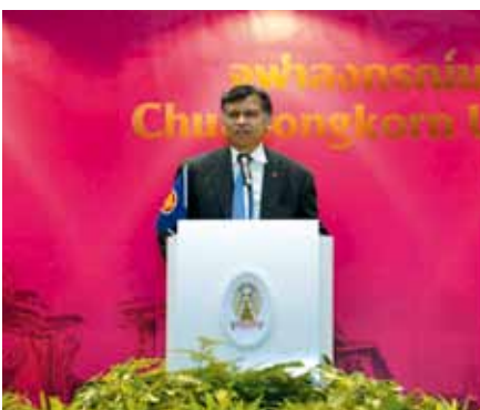
Dr. Surin Pitsuwan, ASEAN Secretary-General

“I have full confidence in Chulalongkorn University’s ability to produce quality people for the entire ASEAN region,” declared ASEAN Secretary-General Dr. Surin Pitsuwan in his speech on February 24, 2012 concerning the university’s role in preparations for the inauguration of ASEAN Community.