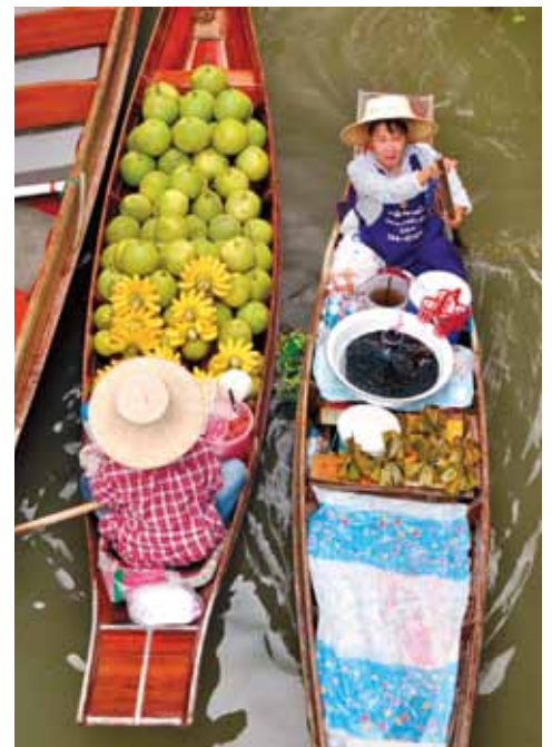
The CU ASEAN Studies Center aims to help Thai society to prepare for the ASEAN Community.

Chulalongkorn University and Thailand now stand on the brink of change, and the ASEAN Studies Center aims to aid in the preparation for this change by uniting the university's efforts and integrating their work into the big picture, thus paving the way to an efficient transition into the ASEAN Community and the establishment of a solid base in ASEAN studies in Thailand.