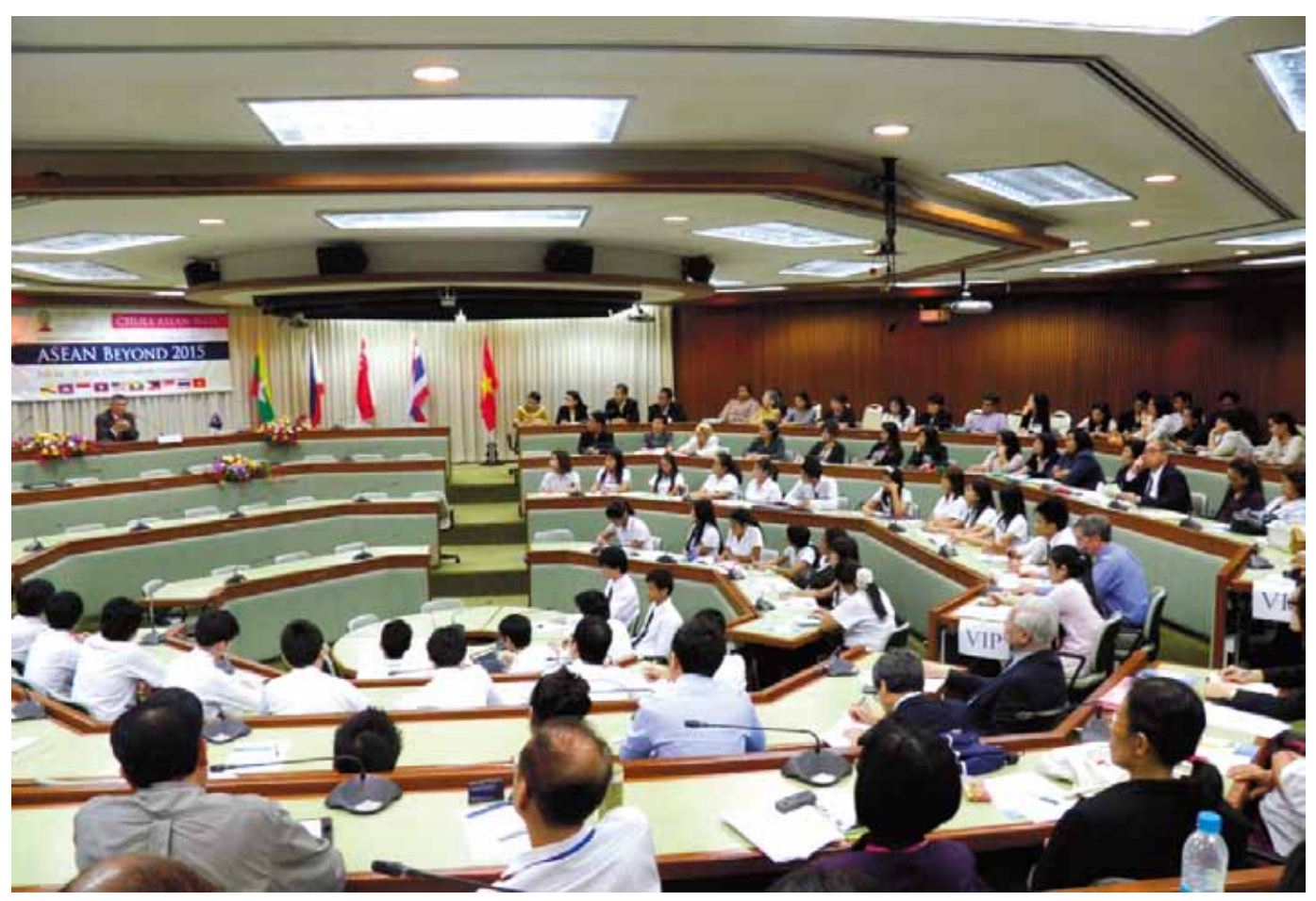
Students, academic staff and the general public attend the "ASEAN Beyond 2015" seminar at CU.

As the year 2015 edges closer, public interest in the ASEAN Community is bound to grow exponentially in anticipation of widespread changes it will bring. With all parties preparing for the coming transformation, Chulalongkorn University – in recognition of its responsibility as a pillar of the Kingdom in ASEAN studies – stands ready to provide support through the establishment of the ASEAN Studies Center of Chulalongkorn University.