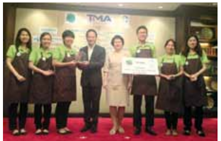
The Green Life Society Team from CU receive the "Green Business Plan" award.

new ideas. If we can get them interested in environmental issues now, then they will eventually become a major driving force behind a greener mindset for society," the group said.